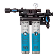
4HC-H Twin Filter