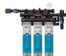
4HC-H Triple Filter